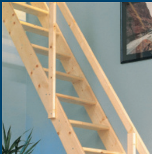
Space saving staircases